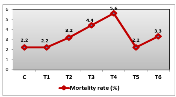
Figure 1. Mortality rate (%) of Cobb broilers as affected by the treated or untreated olive pulp meal containing diets during the whole experimental period. C= Control, T1= (12% OPM), T2= (12% OPM + fungi), T3= (12% OPM + NaOH), T4= (15% OPM), T5= (15% OPM + fungi), T6= (15% OPM + NaOH).

The results of the mortality rate (%) were represented in Figure 1. The highest mortality rate was observed with the group fed on untreated 15% OPM (T4) followed by the OPM treated with sodium hydroxide (T3 and T6) compared to the other treatments. Okorie (2006) indicated that the mortality rate are sensitive indicators of changes in the nutritional qualities of a diet. Al-Shanti et al. (2003) observed that the mortality rate (%) of birds fed different levels of OPM and control diet recorded a nonsignificant difference between treatments.