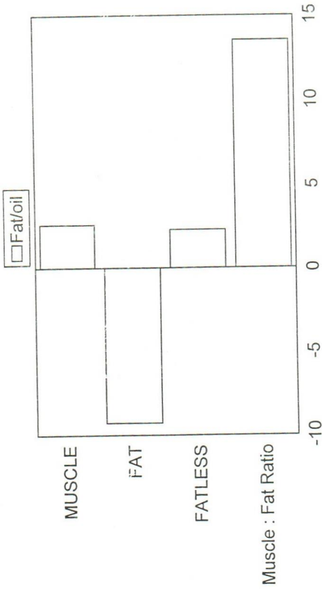
Fig. 2. Effects of dietary lipid sources on carcass composition