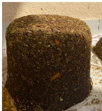
Figure 1. shows the shape of the Multi-Nutrient Concentrate Feed Blocks tested in this study

al. , 2002). Table 1 presents the ingredient composition (DM basis) as well as the three distinct Multi-Nutrient concentrate feed block treatments. Combining concentrated ingredients with micronutrients resulted in the tested Multi-Nutrient concentrate feed blocks. To guarantee thorough and even distribution and reduce the danger of toxicity, they were carefully mixed by hand with the binder, which included both quicklime and cane molasses. Each binder was added individually by spraying it after diluting it with water, as Ben Salem et al. (2000b) recommendations. Since the hydrophilic nature of the pectin in the waste may be destroyed by adding lime (Ben Salem et al. , 2000b). The mixture was firmly compressed well into metal molds that were cylindrical in shape, yielding approximately 2 kg of blocks measuring 20 × 15 cm. The Multi-Nutrient concentrate feed blocks were placed in a well-ventilated, shaded area. They need to be rotated periodically to accelerate the drying process until they are completely dry. Until the animals are given them, the experimental Multi-Nutrient concentrate feed blocks are kept in storage.