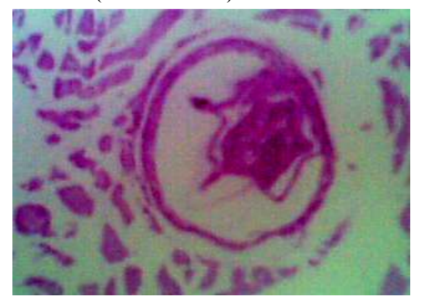
Figure 6: Encysted metacercarae surrounded by slight edema and fibrosis of musculature.